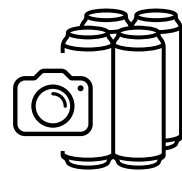
Photo of Product