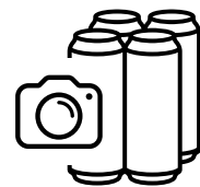
Photo of Product